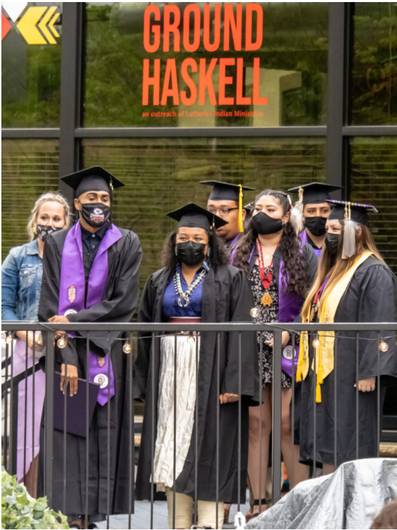
Procession of 2020 and 2021 graduates