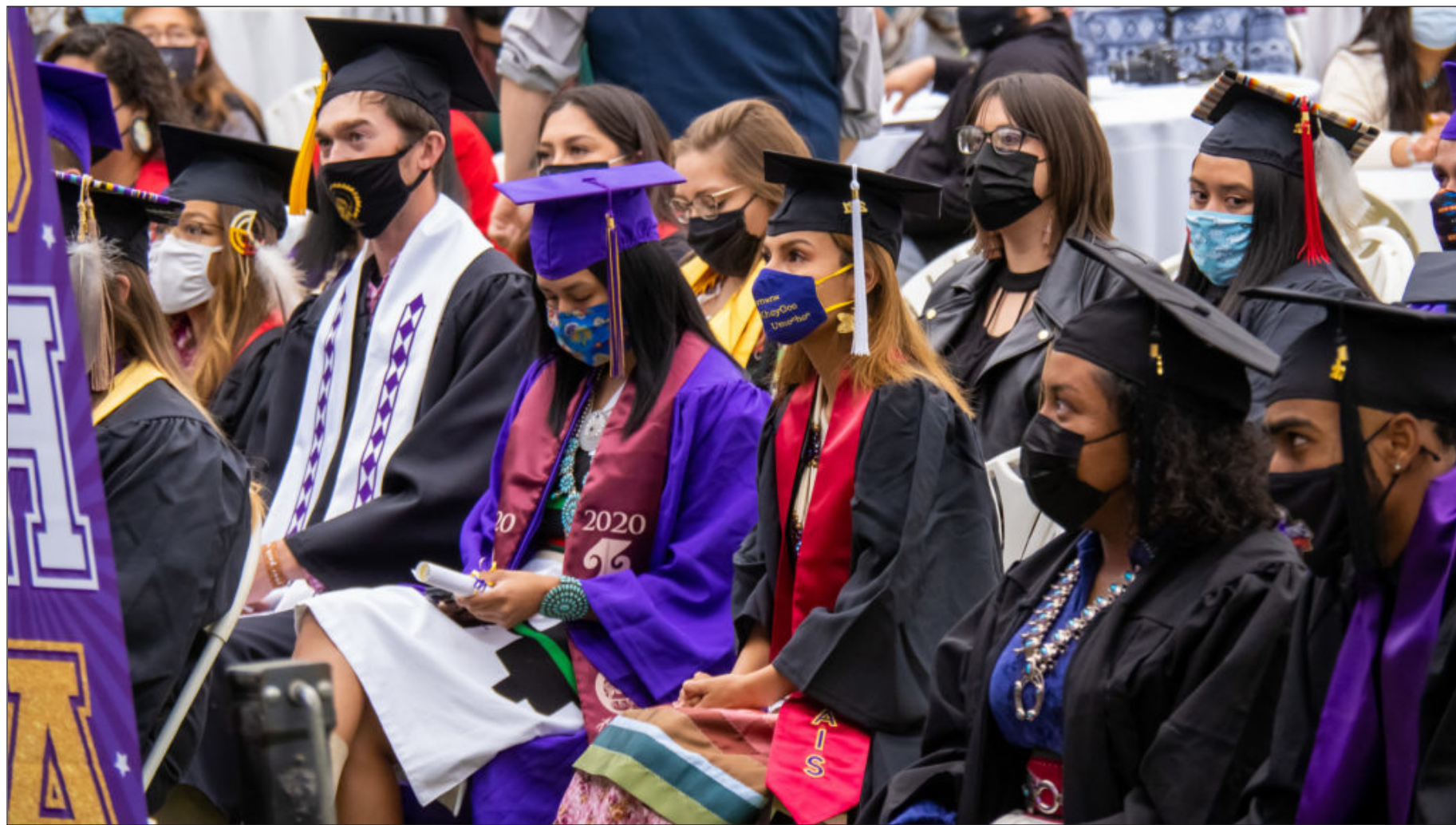
Community-led graduation celebration hosted by Sacred Ground Haskell.