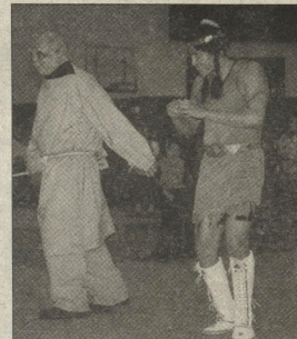
Yoda and Pocahontas shake their hips to music in the Halloween dance off.

Booths were set up with all kinds of games, and lots of prizes were given out. The clubs, residential halls and organizations that participated in this year's event were, Future Indian Teachers, Future Tribal Leaders Association, United Northern Nations Organization, Alaskan Club, Kiowa Cultural Club, United Pueblo Club, Pocahontas Hall, Blalock Hall, Oyate' Club, ACCESS Club, Haskell Volleyball Club, Haskell Artists Association, and the Native American Church.