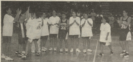
Haskell's 2001 women's basketball team is introduced